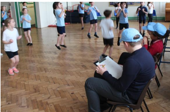
Class dance off in Year 3