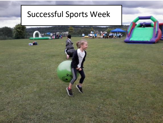
Successful Sports Week