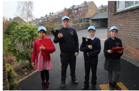
Sports Crew go from strength to strength